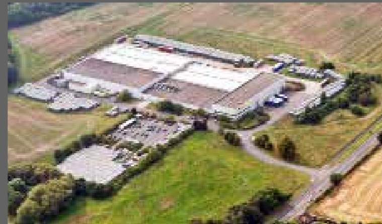
Our Manufacturing Site

From concept to completion our teams collaborate with our clients to ensure that we consistently exceed their expectations.