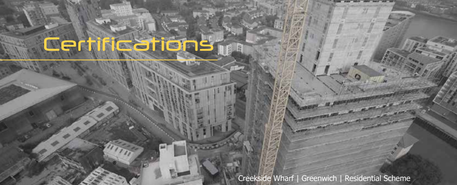
Creekside Wharf | Greenwich | Residential Scheme

Over the years, Elements Europe has obtained a number of prestigious accreditations and certifications, to give our clients confidence that our modular building systems, techniques and procedures are approved to international and industry standards.